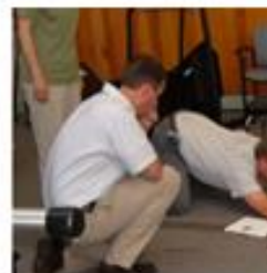
Static & Stance Evaluation