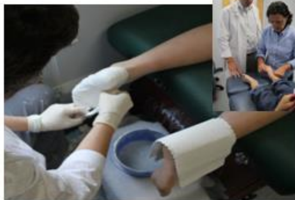
Measurements & Casting