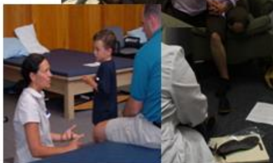
Consultation & Advice